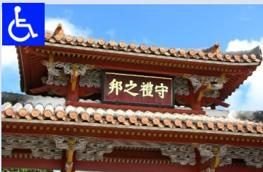
Shuri Castle Park