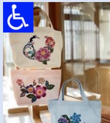
Shuri Textile Museum suikara

A half-day tour to Shuri Royal Castle with time to experience traditional Bingata Dyeing.