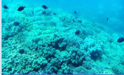
Blue Carbon Cruise "Glass Boat"

A half-day tour to Okinawa Museum/Art Museum and coastal reefs via glass boat.