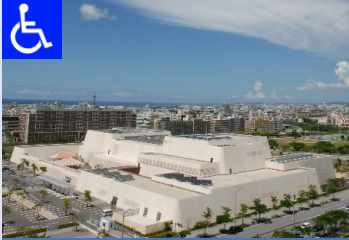
Okinawa Museum/Art Museum