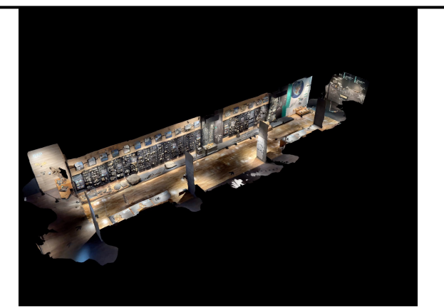
Exibition room of Amakusa Museum of Goshoura Dinosaur Island About 20 m

Exibition room of Oishi Fossil Gallery of Mizuta Memorial Museum Josai University Educational Corporation About 12 m