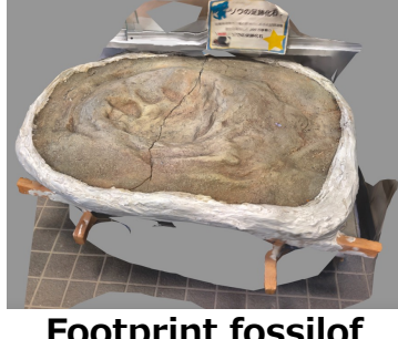
Footprint fossilof Proboscidea About 1 m