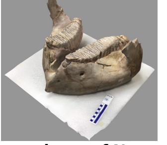
Type specimen of Naumann's elephant's mandible About 60 cm