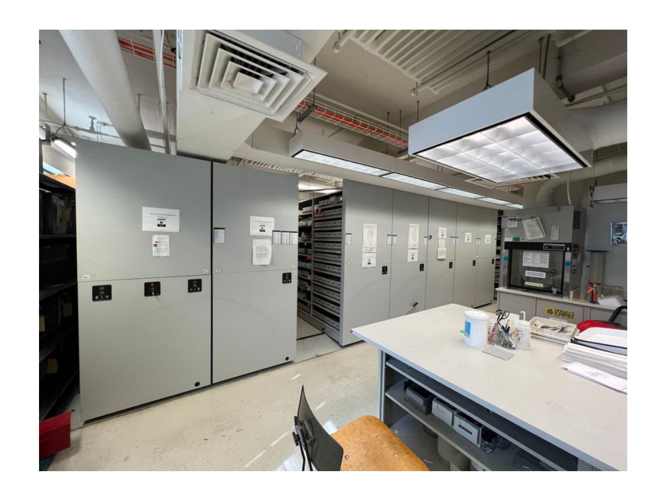
Fig. The INHS Fish Laboratory and a section of the INHS Fish Collection.

Fig. The INHS Herpetology Collection, house to the INHS and UIMH Amphibian and Reptile Collection.