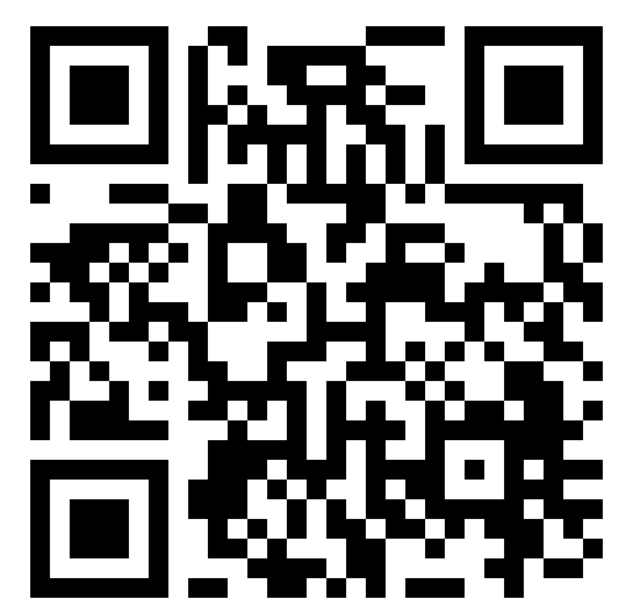
INHS Fish Collection

The associated data of both world-class collections are fully digitized and can be accessed through the INHS Biological Collections website or data aggregators like GBIF and VerNet.