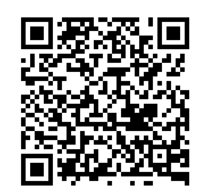
INHS Biological Collections

The INHS safeguards 10 Biological Collections and preserves about 11 million voucher specimens representing the state's biological memory and natural heritage.