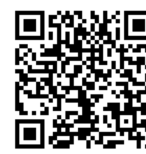
INHS Herpetology Collection