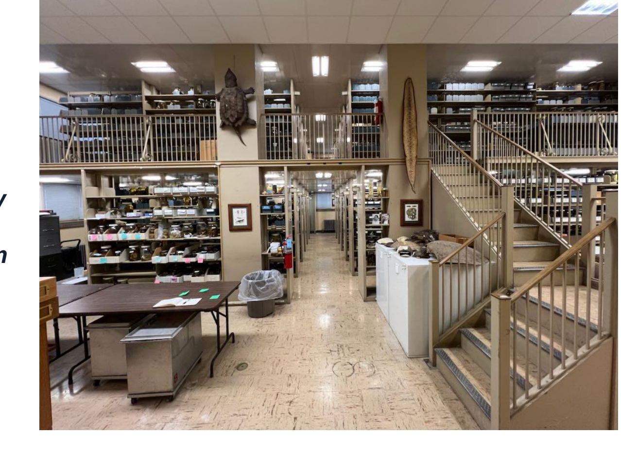
Fig. The INHS Herpetology Collection, house to the INHS and UIMH Amphibian and Reptile Collection.